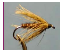
Soft Hackle Pheasant Tail