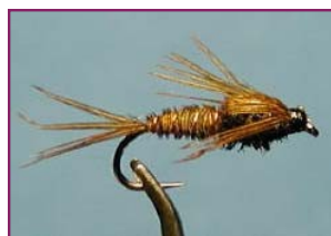
Pheasant Tail Nymph